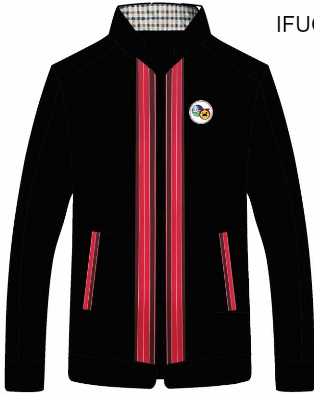
IFUGAO - 14 pieces