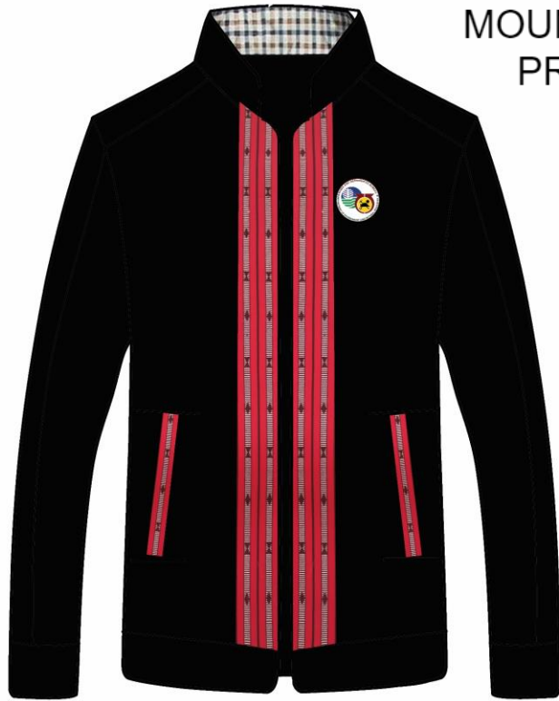
MOUNTAIN PROVINCE - 19 pieces