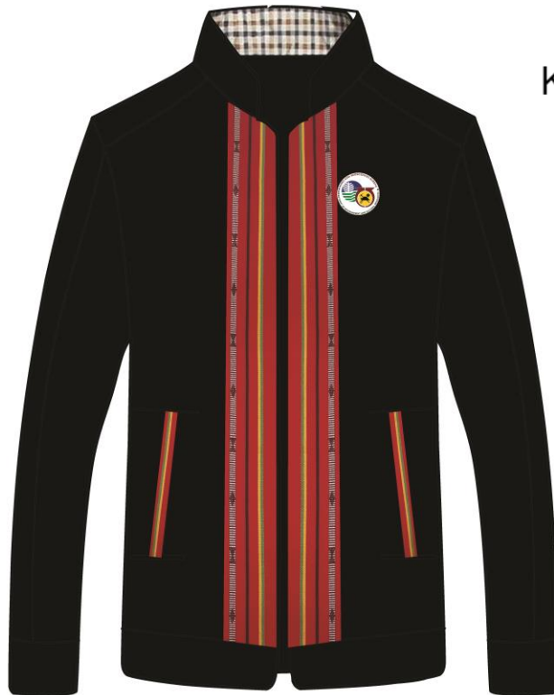
KALINGA - 12 pieces