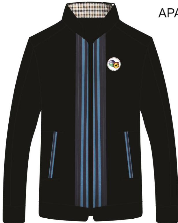
APAYAO - 13 pieces