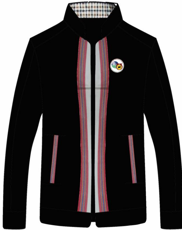
ABRA - 17 pieces