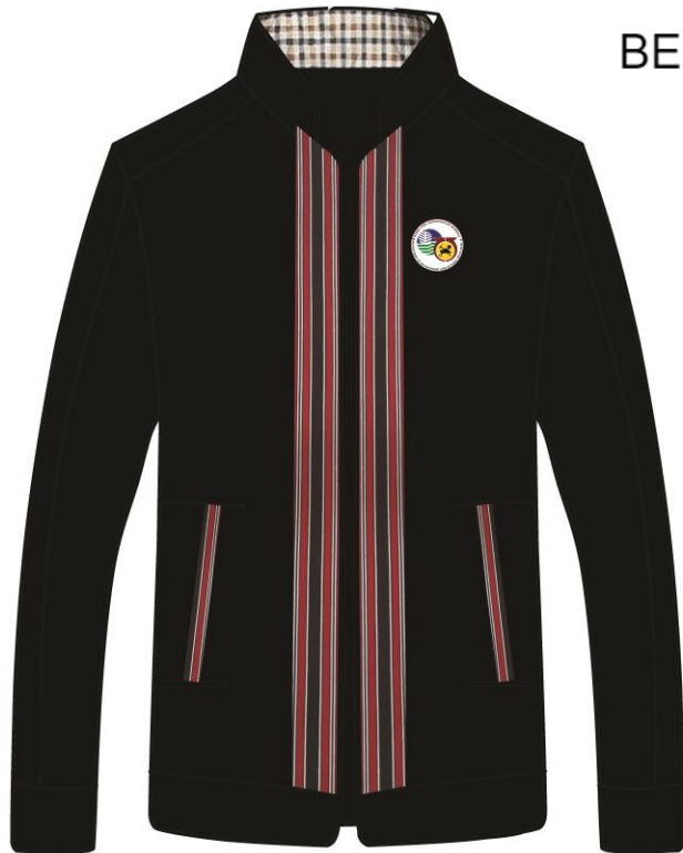
BENGUET - 12 pieces